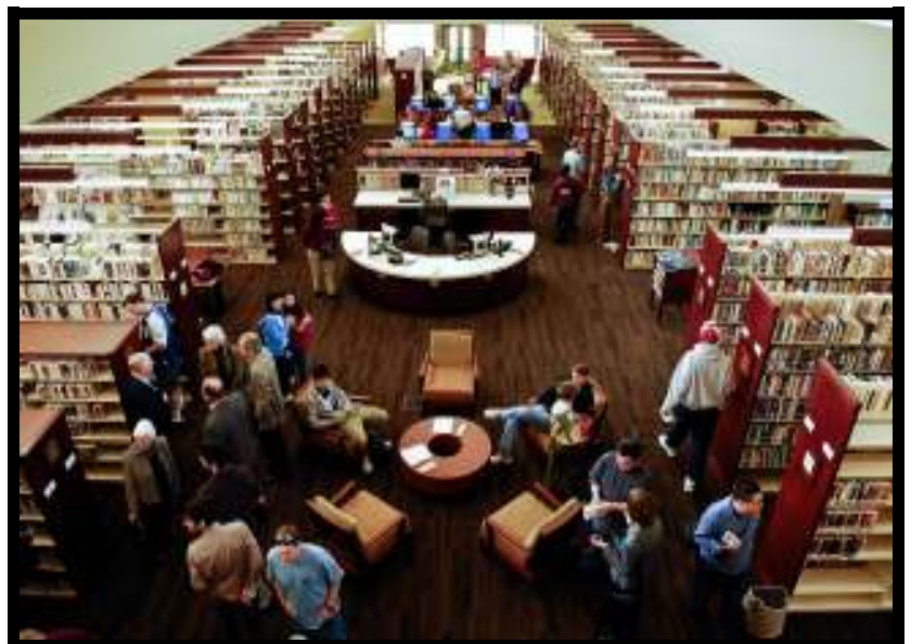
View from second floor conference room balcony.

The Crowell Family grandchildren had the honor of cutting the ribbon and marking the